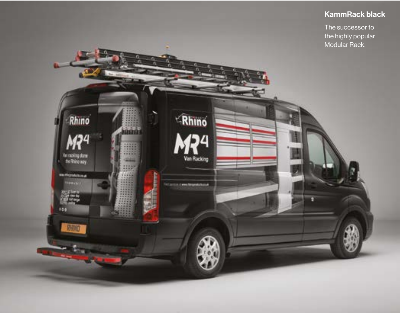
KammRack black The successor to the highly popular Modular Rack.

Effortless ladder storage and handling, eliminates the need to climb onto the roof.