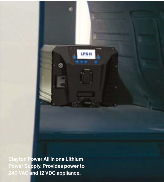
Clayton Power All in one Lithium Power Supply. Provides power to 240 VAC and 12 VDC appliance.