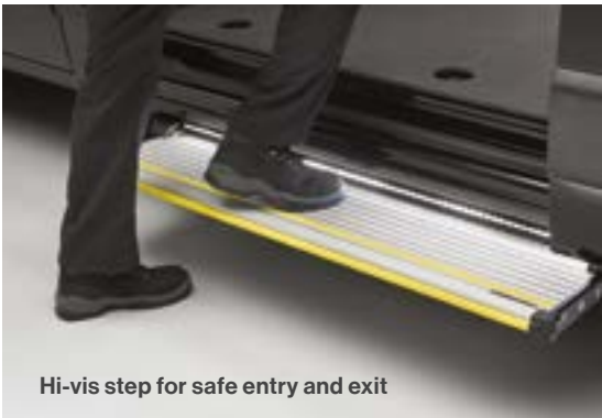
Hi-vis step for safe entry and exit

Every element is designed to make roadside work as comfortable as possible.